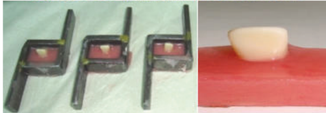
Figure 2: Acrylic block construction.