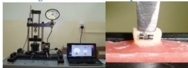
Figure 4: Universal testing machine.