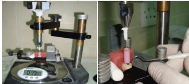
Figure 3: Bracket fixation process.