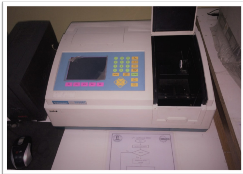
Figure 3. Testing the specimens by UV devise (translucency )