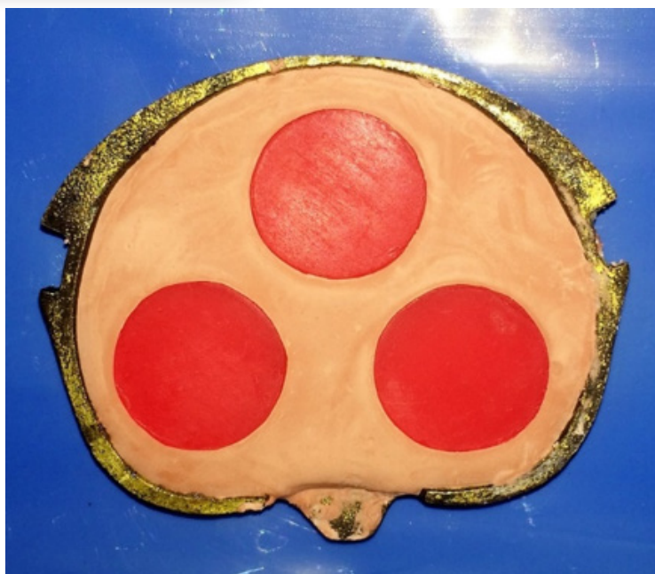
Figure 1. Wax pattern for translucency test

The upper part was coated with a Vaseline following complete set of stone surface, and then positioned over the lower part and filled with dental stone. After one hour, the flask was put into boil out